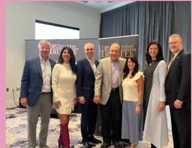
Trustee Luncheon with Hall-of-Famer Johnny Bench~