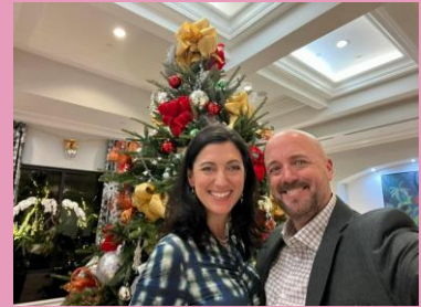
Trustee Holiday Dinner~