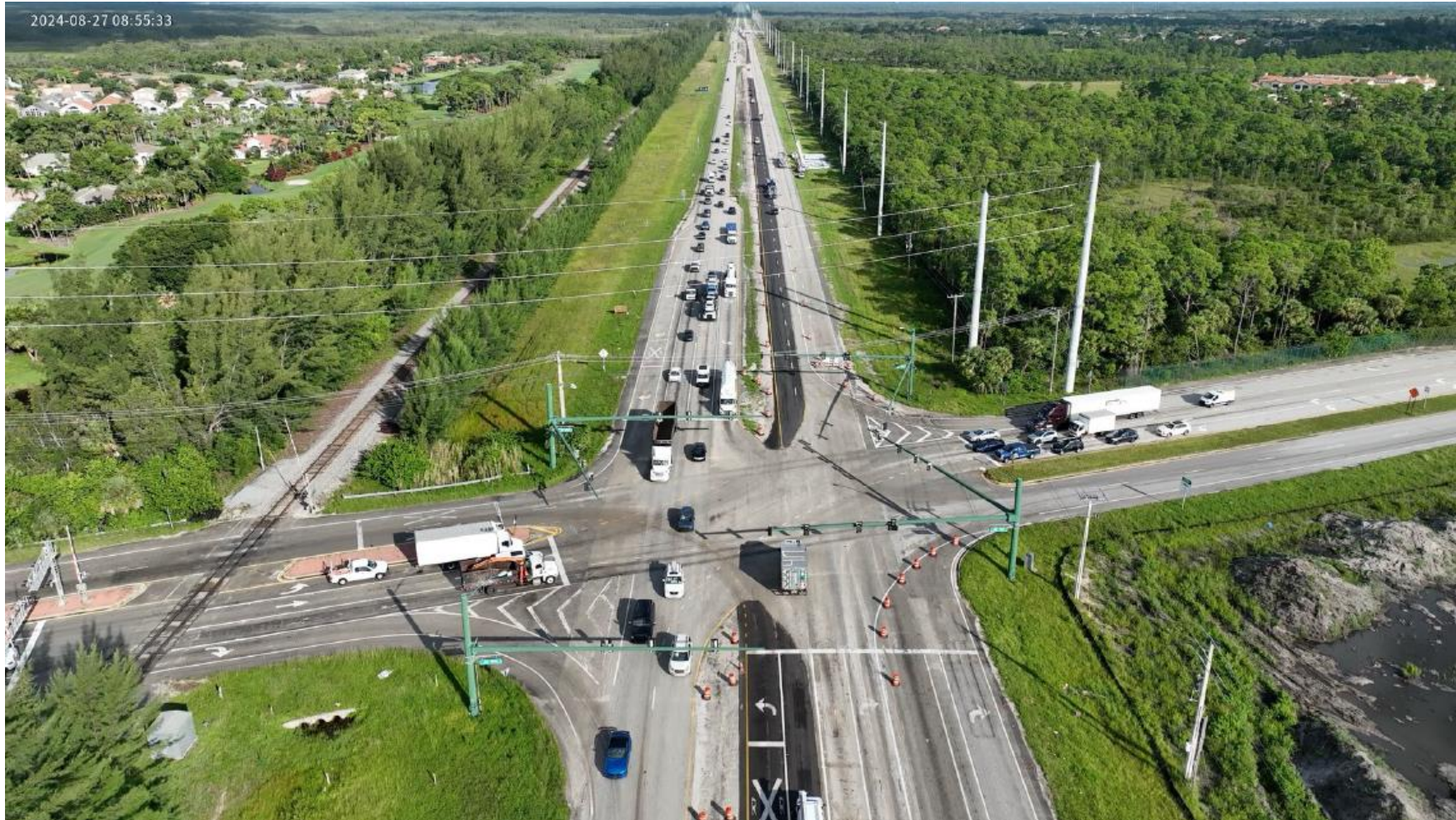
BEELINE HIGHWAY AT JOG ROAD INTERSECTION