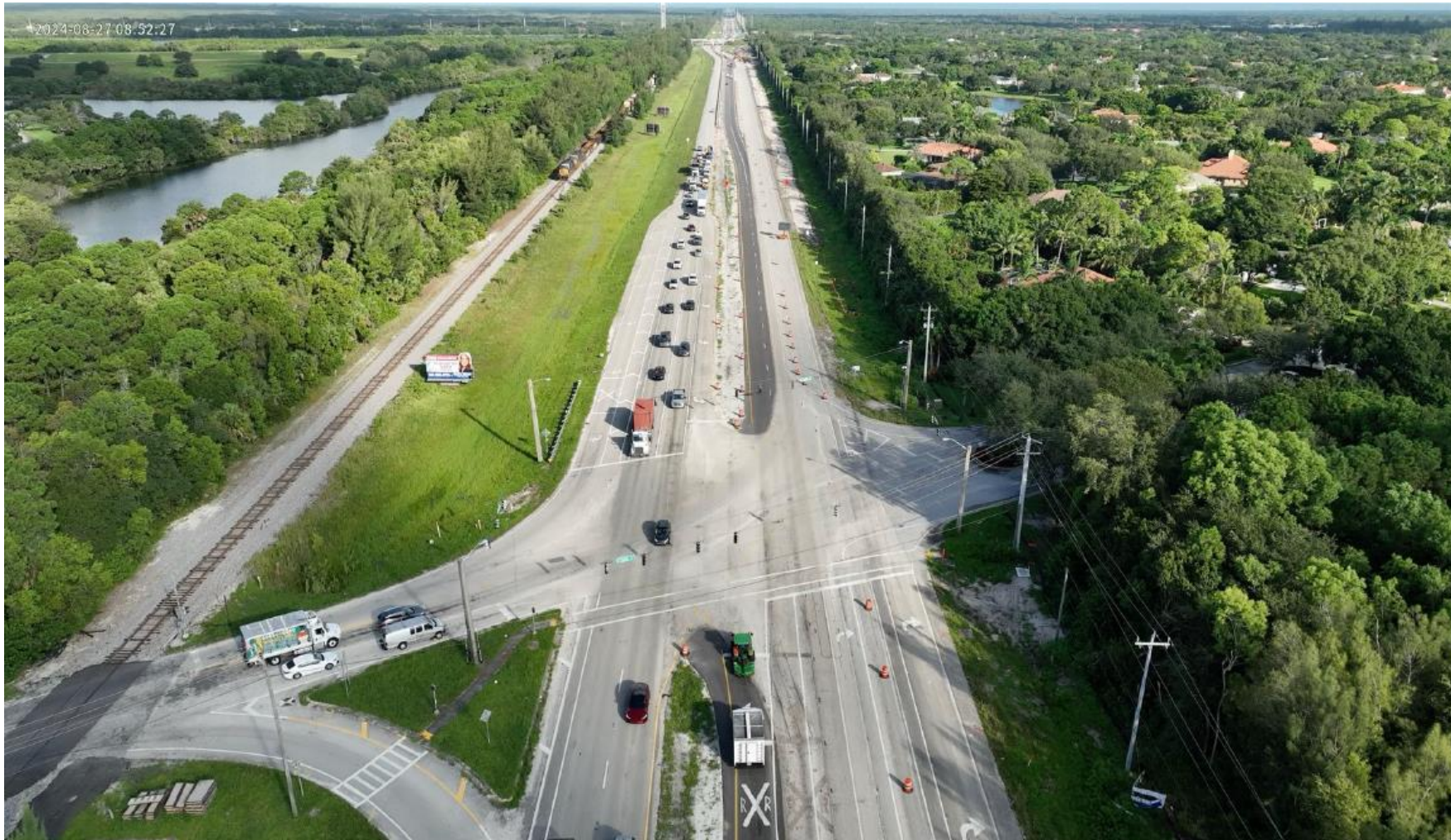
BEELINE HIGHWAY AT HAVERHILL ROAD INTERSECTION