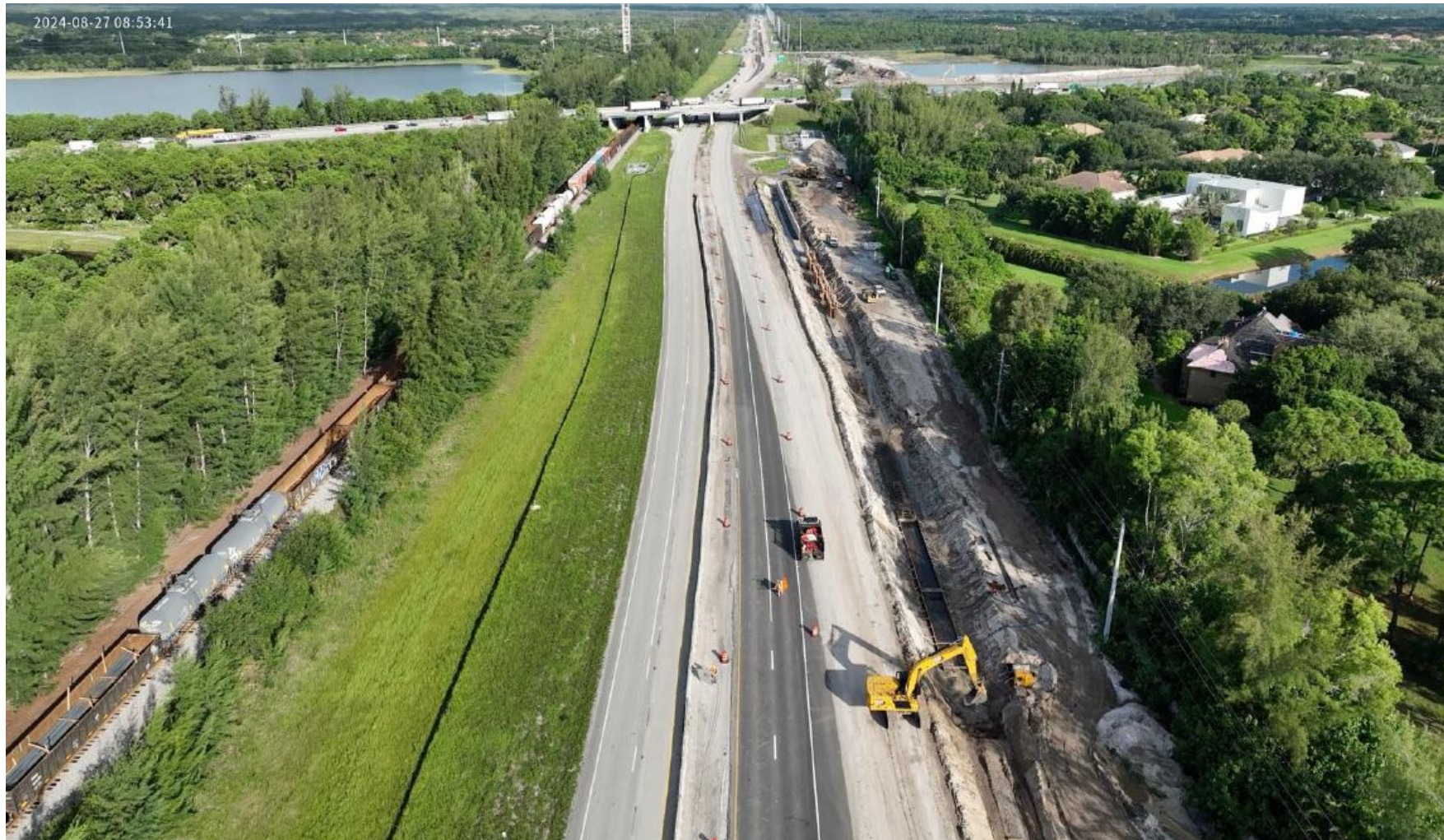
BEELINE HIGHWAY WESTBOUND SHOULDER – WALL CONSTRUCTION