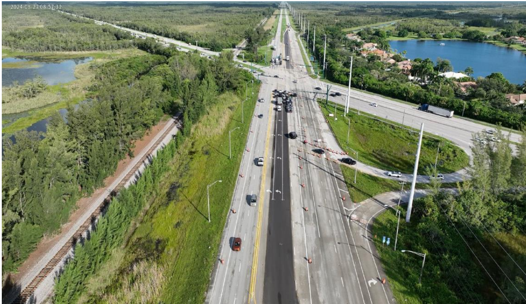
BEELINE HIGHWAY AT NORTHLAKE BOULEVARD INTERSECTION