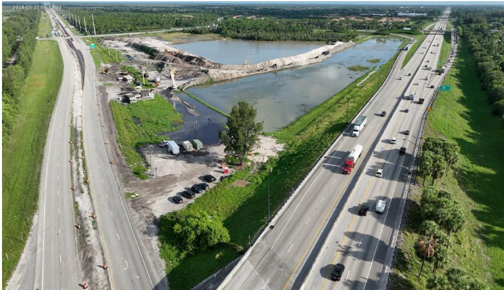
POND EXCAVATION – WEST OF FLORIDA'S TURNPIKE