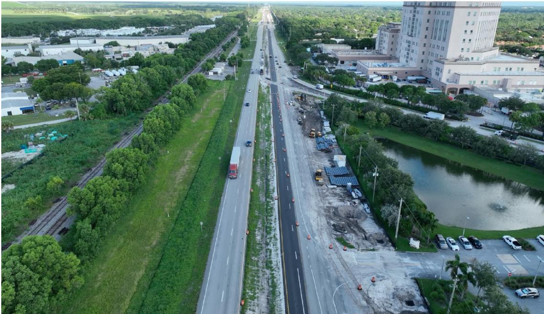
BEELINE HIGHWAY WESTBOUND LANES SHIFTED FOR DRAINAGE/ROADWAY WIDENING