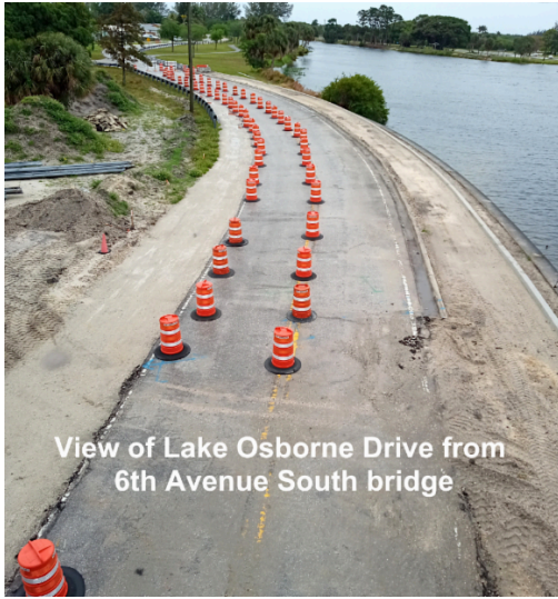
View of Lake Osborne Drive from 6th Avenue South bridge