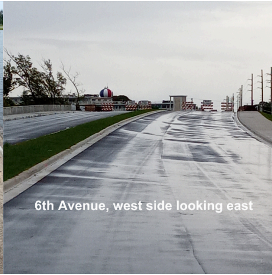
6th Avenue, west side looking east

The remaining work includes roadway widening, traffic railing, grinding and grooving of the bridge deck, guardrail, milling, paving, and embankment. As of today, the project is scheduled to be completed in the 2nd quarter of this year.