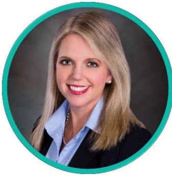
Commissioner Melissa McKinlay Palm Beach County Board of County Commissioners